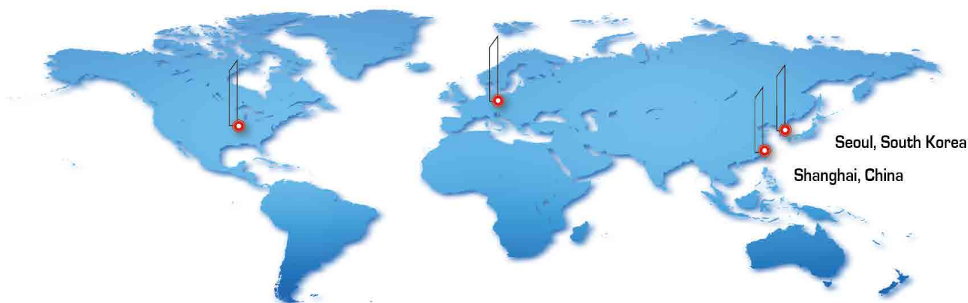
Šumperk, Czech Republic