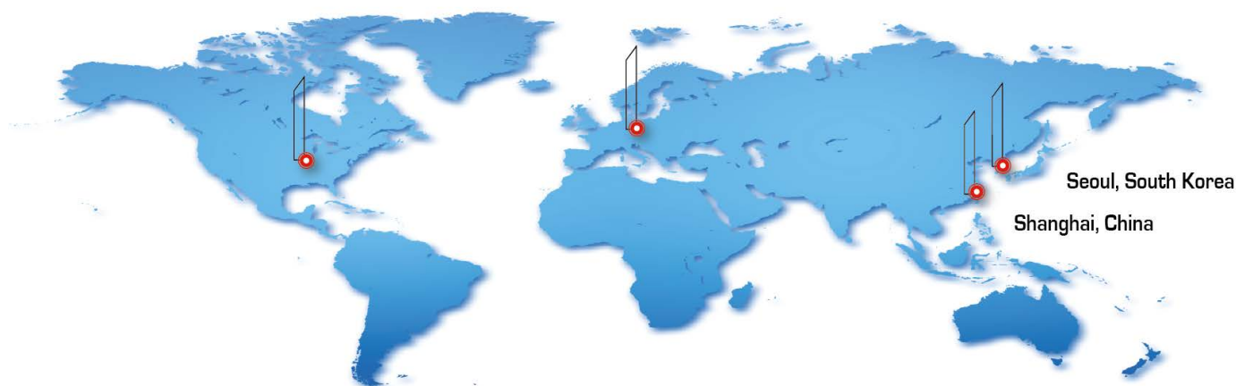
Šumperk, Czech Republic